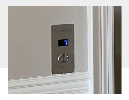
Call Station (Standard)