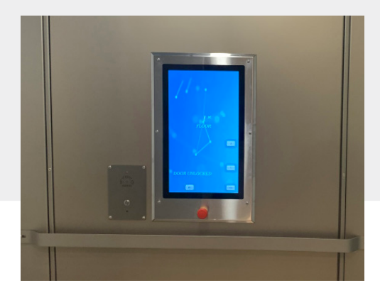
Touch Screen COP (Standard)

There are several options for the Control Operating Panel (COP) to choose from.